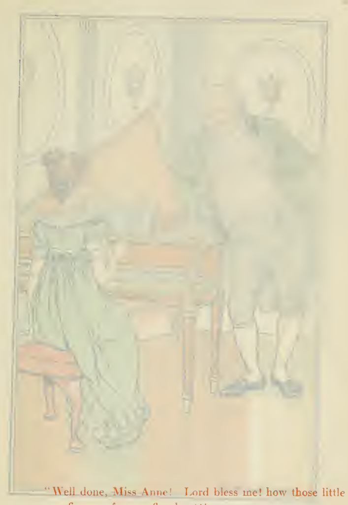
fingers of yours fly about "