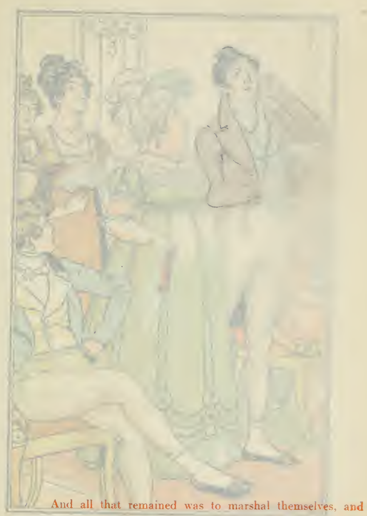
And all that remained was to marshal themselves, and proceed into the Concert Room; and be of all the consequence in their power